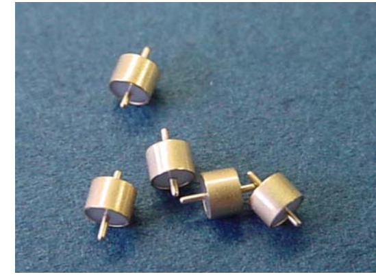
Conventional straight-barrel feedthrus

Our seals are of exceptional quality and dimensional control and are available at competitive prices. We offer "off-the-shelf" delivery time with standard pin lengths and quick delivery times on special pin lengths as well.